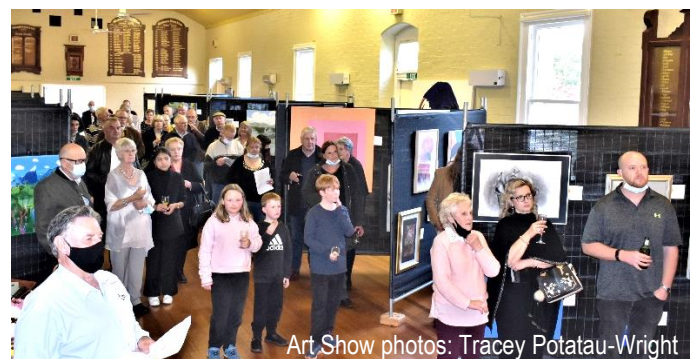
Art Show photos: Tracey Potatau-Wright